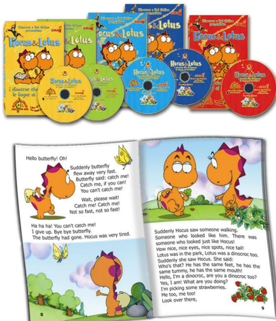
Fig. 2: The set of pedagogical material, DVD, CD and books.