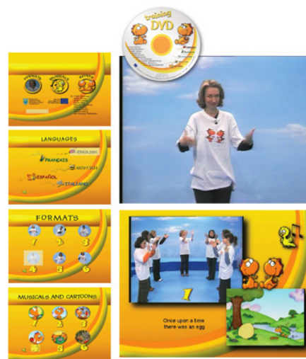
Fig. 3: DVD content with training activities for teachers

Various sessions of training divided within thematic modules were organised with the participant teachers in order to introduce the main principles of the narrative format. Some of the topics of the training included items concerning interculturality, plurilingualism and school-families relations. Furthermore, specific DVDs devoted to the training, for different school degrees, were offered to the teachers in order to allow them to train themselves at home. The DVD explained and illustrated each narrative formats, through videos in which actors were playing each format (see Figure 3). Further explanations were given to teachers by the trainers (members of the research team) in order to highlight the importance of gestures and mimics which can differ from one language to another.