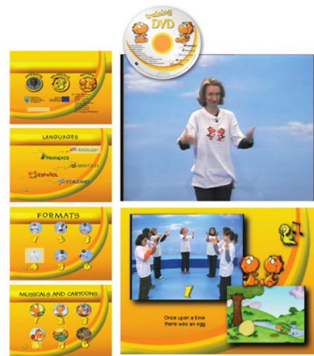
Fig. 3: DVD content with training activities for teachers

Various sessions of training divided within thematic modules were organised with the participant teachers in order to introduce the main principles of the narrative format. Some of the topics of the training included items concerning interculturality, plurilingualism and school-families relations. Furthermore, specific DVDs devoted to the training, for different school degrees, were offered to the teachers in order to allow them to train themselves at home. The DVD explained and illustrated each narrative formats, through videos in which actors were playing each format (see Figure 3). Further explanations were given to teachers by the trainers (members of the research team) in order to highlight the importance of gestures and mimics which can differ from one language to another.